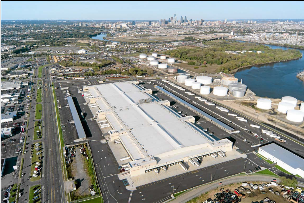
The Philadelphia Wholesale Produce Market pictured from the air. Located on Essington Avenue in Southwest Philadelphia, the facility is the most recent addition to the portfolio of the Philadelphia Regional Port Authority.

The Philadelphia Wholesale Produce Market’s main building is 686,000 square feet, which is larger than 14 football fields. Merchants independently control their particular coolers’ temperatures, with a range of 32° to 60 °F. The facility also boasts a banana ripening unit, a restaurant, a conference room / board room (which was used for the WTA event), and an impressive trash recycling building behind the main structure.