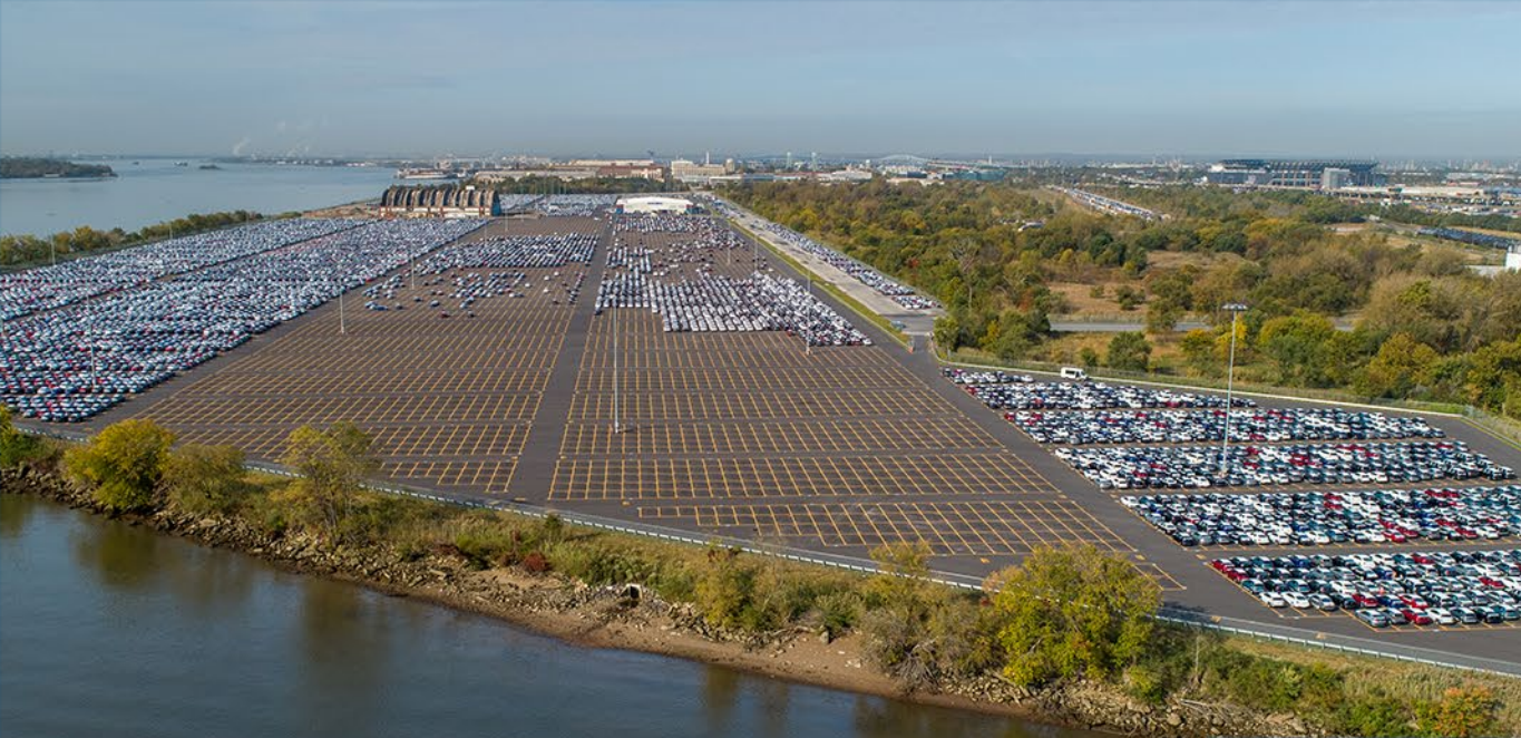
PhilaPort Auto Complex